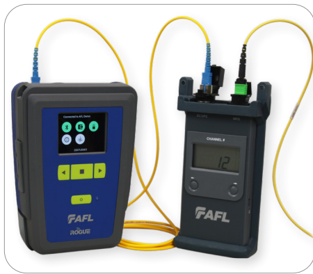
Multi-fiber Switch paired with ROGUE